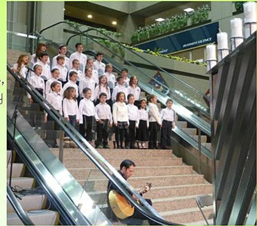
(right) The Akiva Academy Choir delights the crowd

BROADCASTED LIVE ON SHAW CABLE TV AND LIVE ONLINE AT MENORAH.CA AND REBROADCASTED FOUR TIMES THROUGHOUT CHANUKAH!!