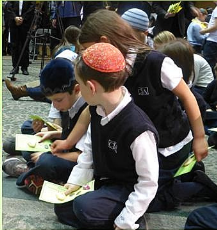
(left) Children enjoy Chanukah Gelt Cards with gummy cookies, Chanukah gelt, and delicious candy!