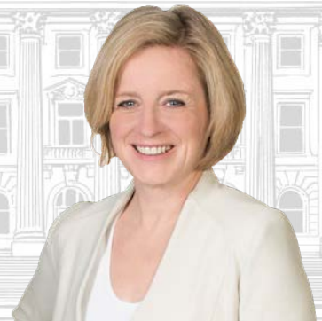
Rachel Notley, Premier of Alberta

A handwritten signature in blue ink, appearing to read 'R. Notley', written over a horizontal line.