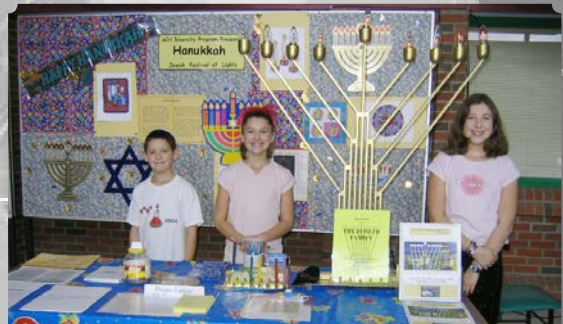
Chabad's Chanukah display at the Alberta Children's Hospital - 2005 / 5766