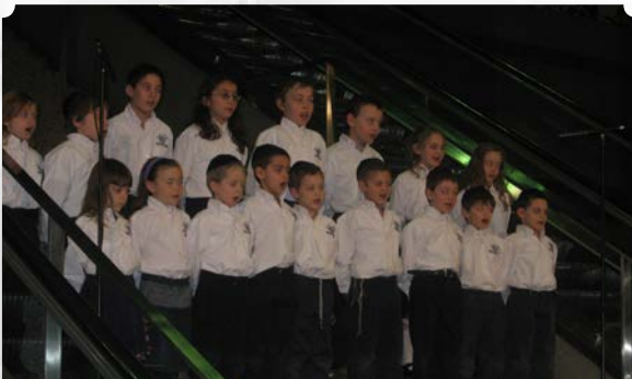
Akiva Academy Choir 2007 / 5768