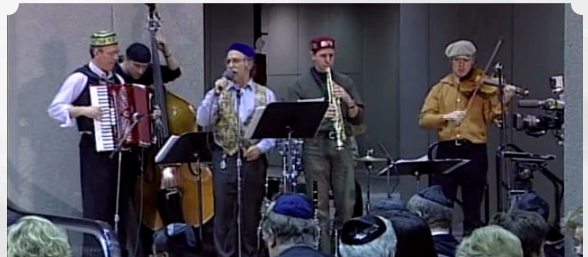
KlezMerovitz 2003 / 5764

I believe with complete faith In the coming of the Messiah, I believe Believe in the coming of the Messiah And even though he may tarry Nonetheless I will wait for him