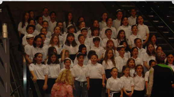
The Calgary Jewish Academy Choir 2004 / 5765