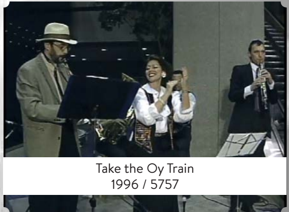
Take the Oy Train 1996 / 5757