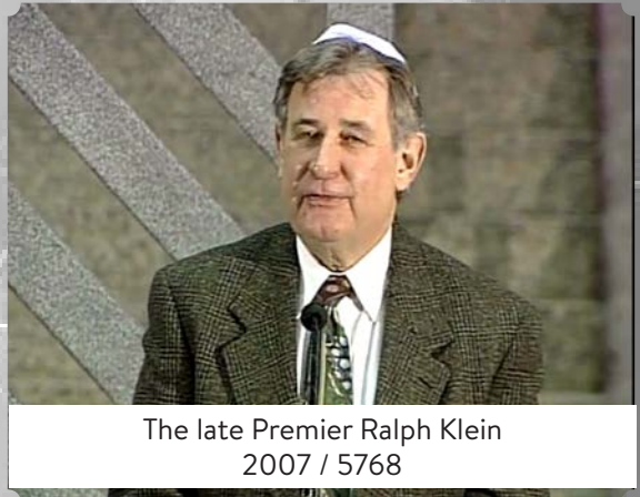
The late Premier Ralph Klein 2007 / 5768