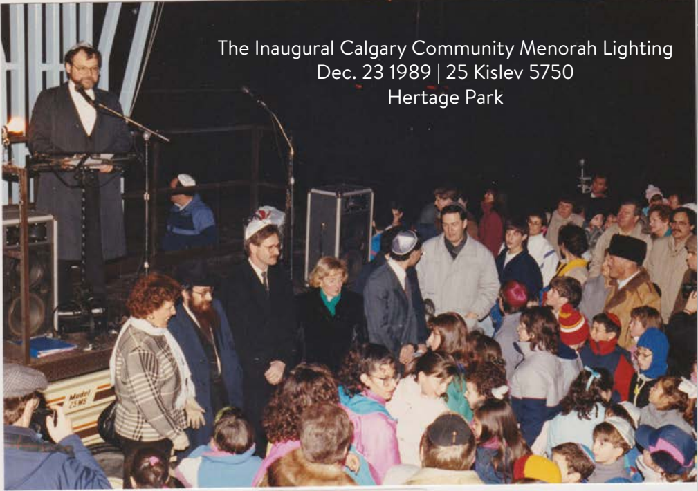
CALGARY 1ST CHAIKMAN COMMUNITY MENORAH SPONSORED BY CHASAB - LUBAVITCH